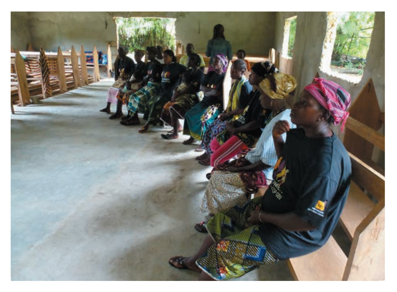
Members of an NRC Wise Women group gathered in a community meeting space

The relationship between Liberian women's HLP rights and their vulnerability to SGBV is poorly understood. Researchers set out to provide robust evidence linking stronger HLP rights for women to a decreased incidence of GBV. This study seeks to tease out and analyse correlations between GBV and HLP security among urban and peri-urban women in Monrovia. It is hoped it may help expose potential risks that may result from HLP interventions, inform future programmatic developments and highlight areas in need of further study.