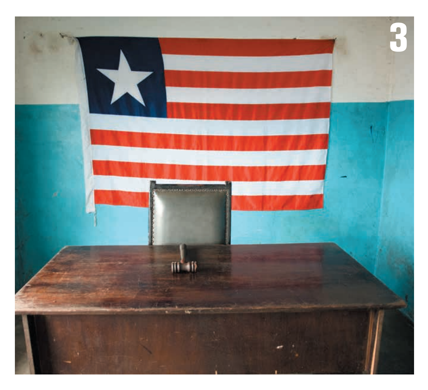
BRIEF LEGAL REVIEW