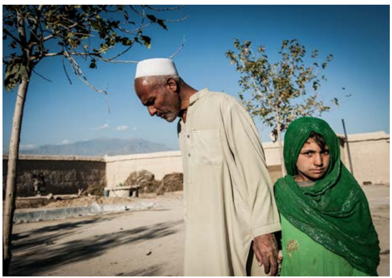
IDPs in Laghman province (November 2013).

Afghanistan's 2004 Constitution guarantees a number of rights to housing, land and property relevant to the prohibition on forced evictions.<sup>42</sup> Under article 40(4), "nobody's property shall be confiscated without the provisions of law and the order of an authorized court." Article 38 further provides that, "no one, including the state, shall have the right to enter a personal residence [...] without the owner's permission or by order of an authoritative court, except in situations and methods delineated by law." 43 Article 14 requires that "the state shall adopt necessary measures for provision of housing and distribution of public estates to deserving citizens in accordance with the provisions of law and within financial possibilities."44 However, none of the evictions planned or carried out in the studied communities had been authorised by a court order.