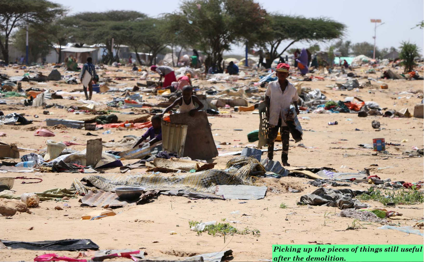
Picking up the pieces of things still useful after the demolition.