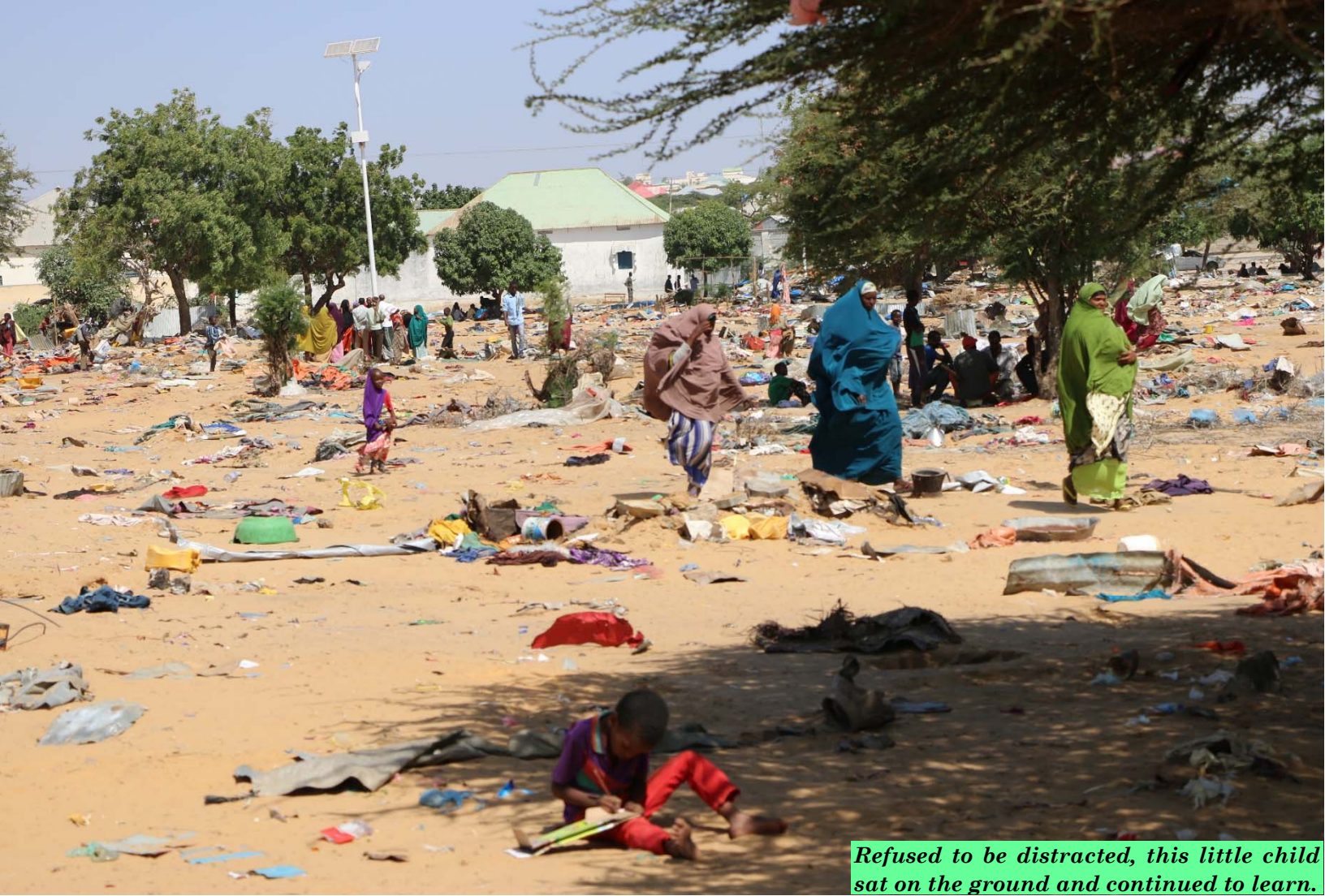
Refused to be distracted, this little child sat on the ground and continued to learn.