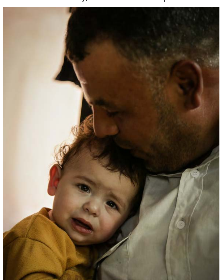
A 36-year-old father worries about his son's future, as he does not have a birth certificate.

Lack of a birth certificate could also affect a family's ability to travel together, imperiling family unity, a right protected under international law and an important principle of refugee protection.<sup>93</sup> Families may encounter problems taking unregistered children to Syria (or a third country) when circumstances permit their travel