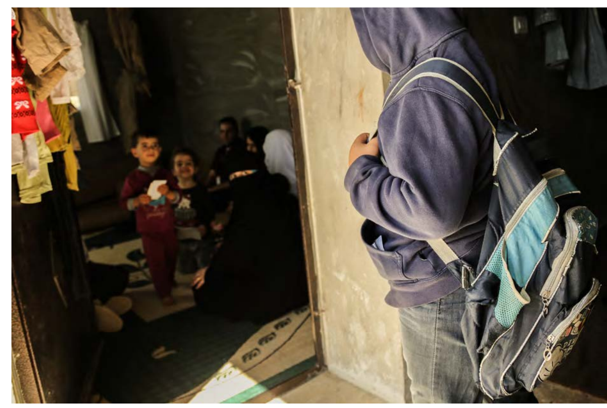
A Syrian refugee family in their house in Irbid. The mother and father have struggled to register their marriage and children's births in Jordan.

In addition to Mol registration, Syrian refugees