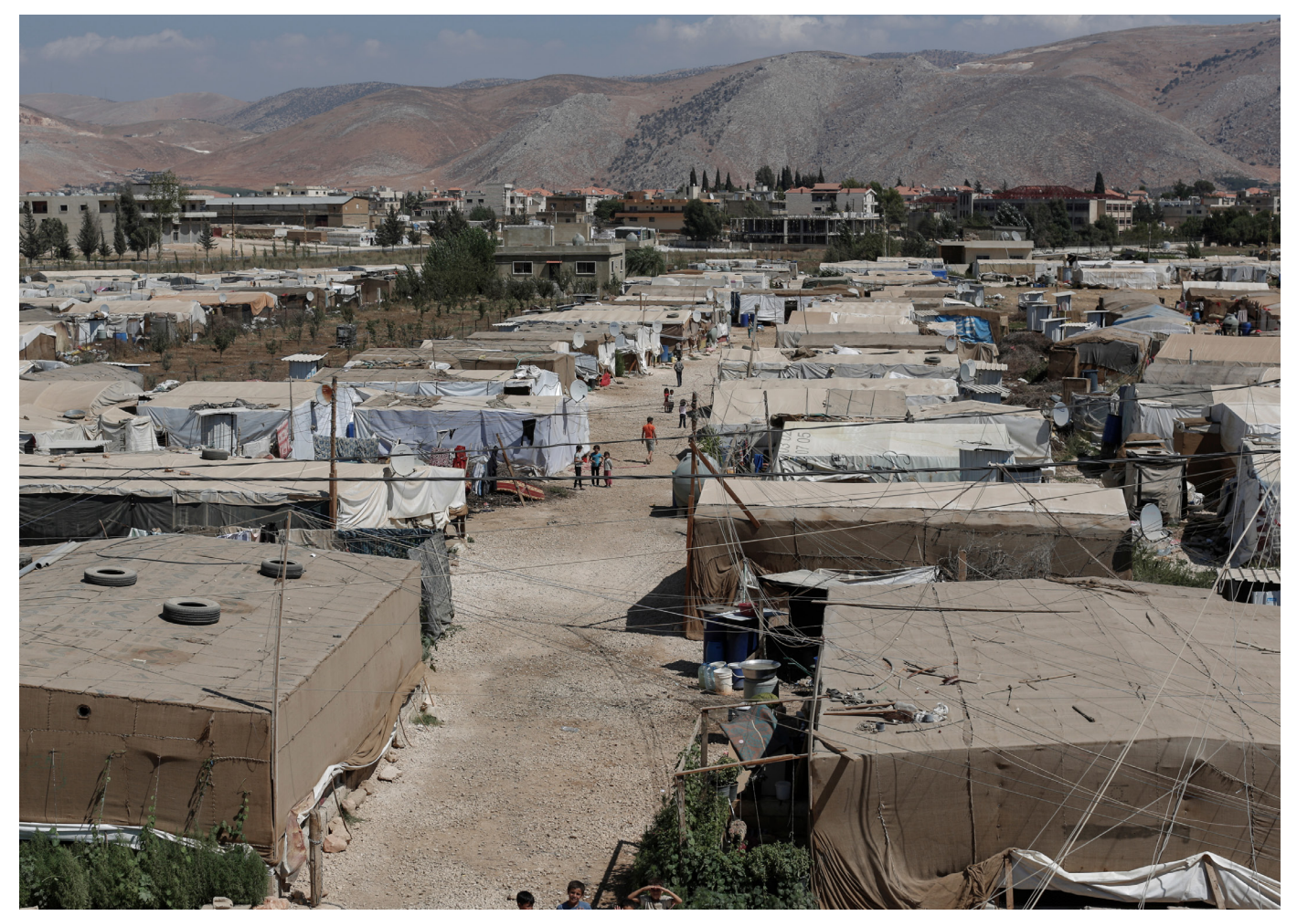
As homes and collective shelters fill up throughout Lebanon, it has become harder to find appropriate shelter for all Syrian refugees, as for the refugees living in this settlement in Lebanon's Bekaa Valley. Rising rental prices mean poor Lebanese families are also suffering.

European countries are not doing enough to resettle Syrian refugees. The notable exception is Germany (28,500 spaces pledged).<sup>(70)</sup> In contrast, France pledged to resettle a mere 500 refugees while the UK has said it will only take a few hundred. <sup>(71)</sup> Although Canada has pledged over 1,000 places for private sponsorships, resettlement places for Syrians referred by UNHCR are limited to only 200 persons.<sup>(72)</sup>