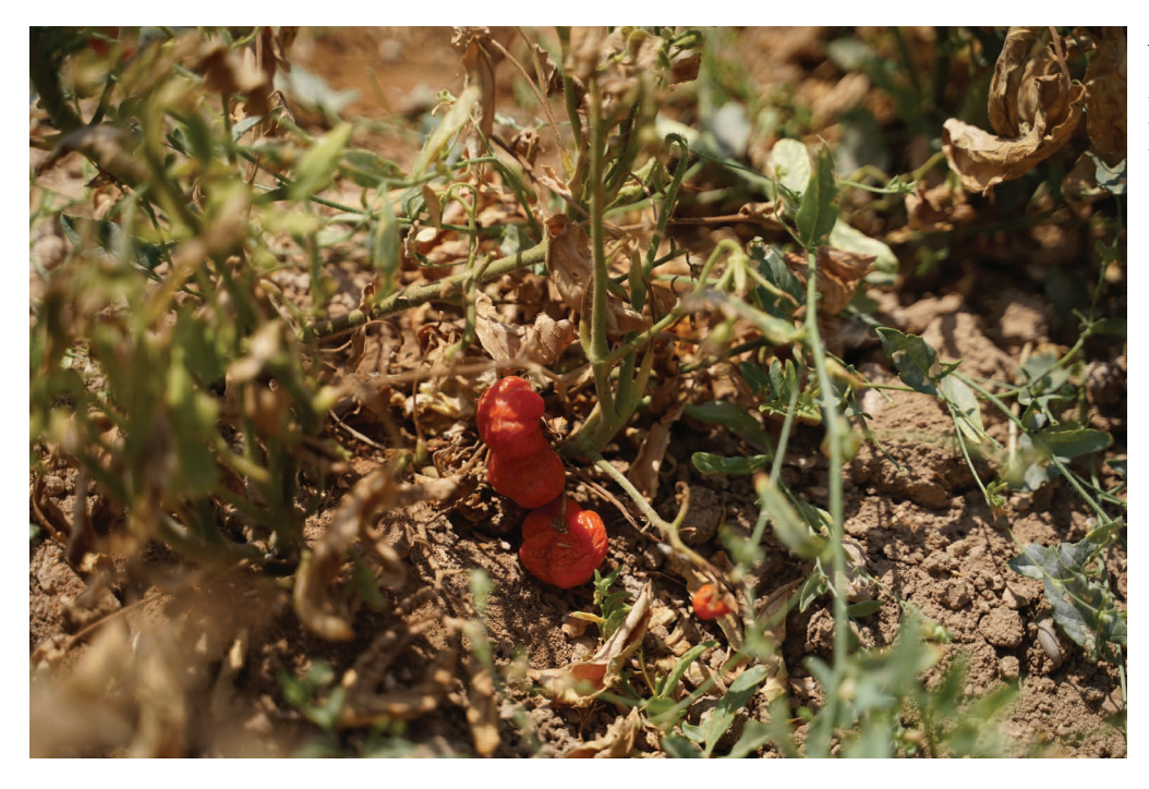
A farmer's destroyed tomato crop in Ninewa governorate, Iraq as a result of the drought in 2021.

Iraq has been identified as the fifth most vulnerable country globally to decreased water and food availability, extreme temperatures, and associated health problems.<sup>2</sup> While the drought has already had immediate devastating effects in 2021, increased and continued water scarcity exacerbated by climate change could reverberate to urban areas as a result of the displacement of farmers and temporary wage workers who have lost their means of income. Without targeted assistance and policy measures, the drought and climate impact will serve as another displacement driver and devastating blow on the lives of displaced persons, returnees, and vulnerable communities in Iraq.