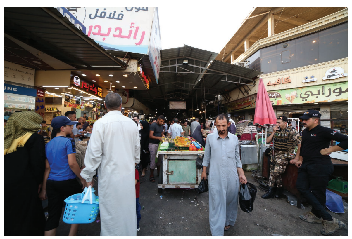
Families shop for food items and groceries in Al-Nabi market in East Mosul, Iraq.

Furthermore, the drought has had evident socioeconomic repercussions that impact food accessibility among Iraqi households. The declining monthly income for farmers and daily laborers has presented challenges in financially accessing food. Across all drought-affected governorates, households report difficulties obtaining food because of a lack of income and the spike in prices. In all governorates except Kirkuk governorate, the main difficulty in accessing food is the income to purchase it. Meanwhile, respondents in Hawija and Kirkuk districts both reported that the main difficulty is not enough quantity and types of food sold in markets, which could be attributed to increased import costs as a result of challenges around strictly controlled checkpoints, alongside low incomes to afford commodities.