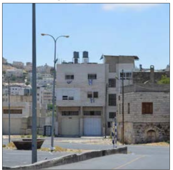
Photo: Beit Hamachpela Outpost, Hebron

The settlers claim to have purchased the third floor of the building, dubbed "Beit Hamachpela", or "House of the Patriarchs", as well as a storage room on the first floor, and the garden, from the Palestinian owners. However, Israeli military law requires that all purchases by Israeli civilians in Palestinian localities in the West Bank must be approved by the Israeli Civil Administration, and Israel's Minister of Defense. No such approval was given in this case.