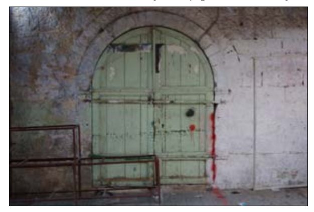
Photo: A shop closed beneath Beit Hadassah

In April 2005, the High Court dismissed ACRI's 2003 petition and decided not to intervene with the Military Commander's discretion.<sup>279</sup> Thus, the fears expressed by the Palestinian shop owners in 1986 ultimately came true. They have effectively been forced from their properties. The Court accepted the State's position, according to which the military's