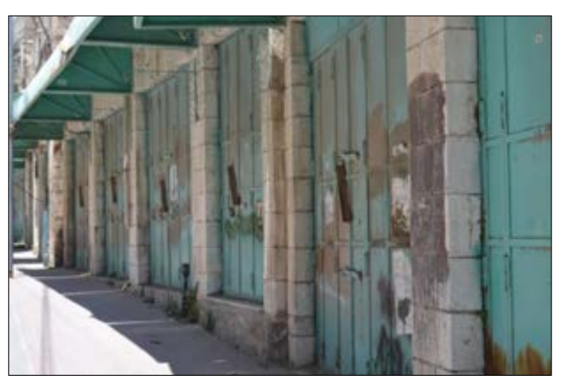
Photo: Closed shops in the Hebron's Old City

In 2003, ACRI filed a High Court of Justice petition challenging the closure of more than 100 shops in the Shalala compound, located next to the foundations of the Beit Hadassah settlement and in