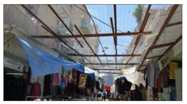
Photo: Metal screening installed to protect Palestinian pedestrians in Hebron's Old City

In several areas of the Old City, metal screening has been placed over pedestrian walkways that run below the Avraham Avinu and Beit Hadassah settlement buildings to prevent settlers from throwing garbage, bricks, stones and empty bottles at the passersby below.<sup>165</sup> This screening, however, provides no protection against dirty water or urine that may be thrown from the settlements onto the streets below.<sup>166</sup> It has been proposed that additional Plexiglas sheeting should be erected above the streets to protect Palestinian pedestrians.