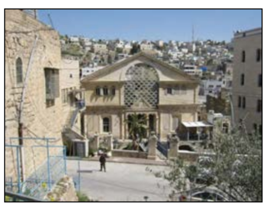
Photo: Al Dabbuya/Beit Hadassah, Hebron

In 1979, a group of 10 women and 40 children living in the nearby settlement of Kiryat Arba moved into the Beit Hadassah building.<sup>55</sup> The Israeli government led by Prime