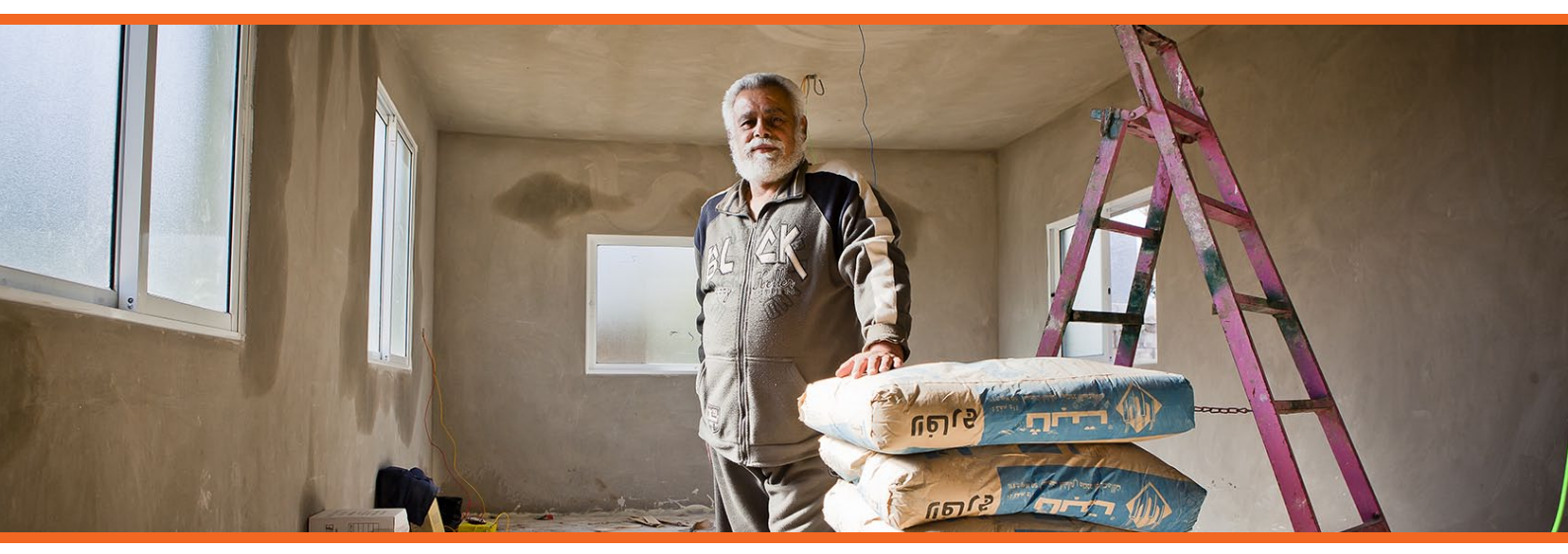
Jordanian landlord poses for a photo in an unfinished housing unit in Irbid, Jordan.

In KR-I , findings from a Multi Sector Needs Assessment (MSNA) stated that 76% of all Syrian refugees who live in non-camp settings in Erbil Governorate only have verbal agreements for their housing.<sup>(29)</sup> An NRC assessment in KR-I in April 2014 in neighbourhoods where the majority of the most vulnerable refugees reside, puts the figure closer to 98%. The MSNA also found that 21% of refugees in non-camp settings have moved at least once since arriving in KR-I, whether by choice, or due to forced eviction.