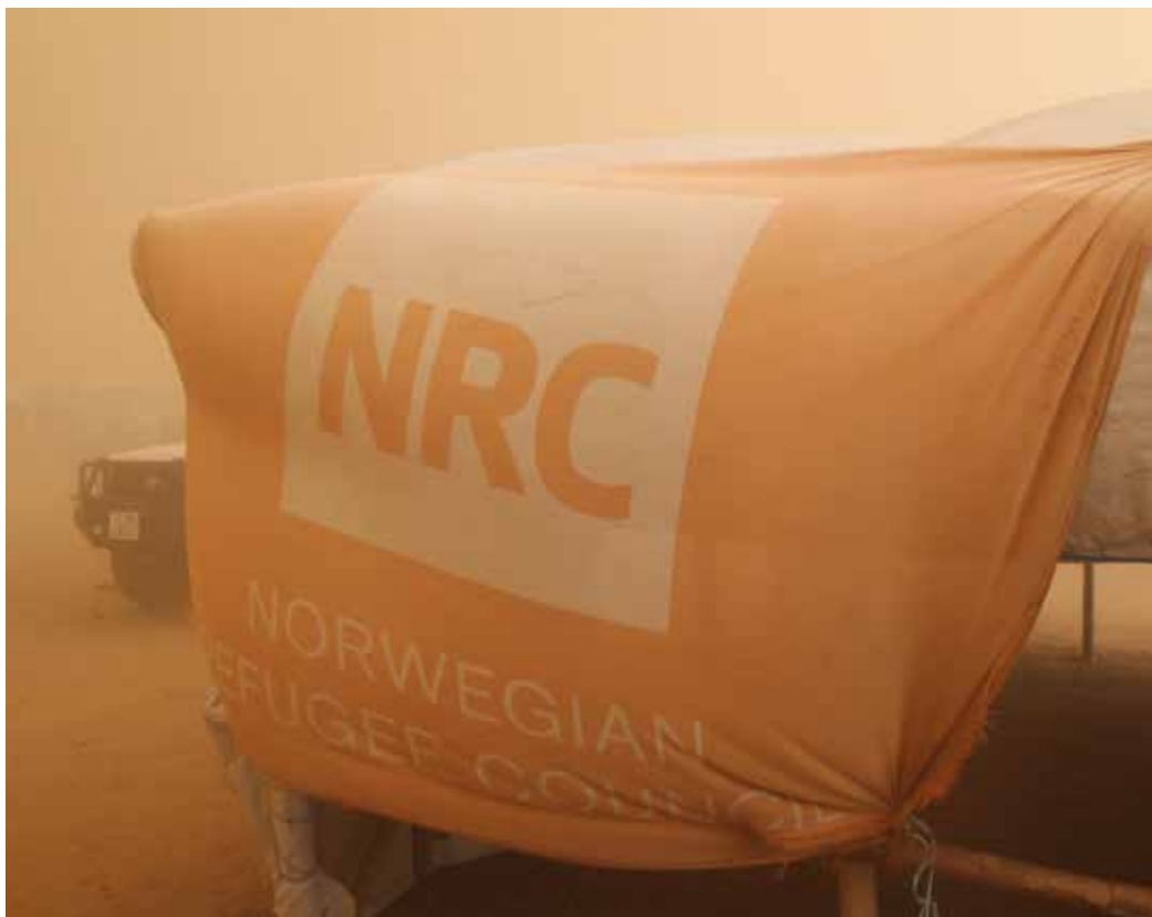
A sandstorm quickly overtakes Goudebo camp, in Burkina Faso.

We take action during situations of armed conflict, and engage in other contexts where our competencies will add value. We are a rights-based organisation and are committed to the principles of humanity, neutrality, independence and impartiality.