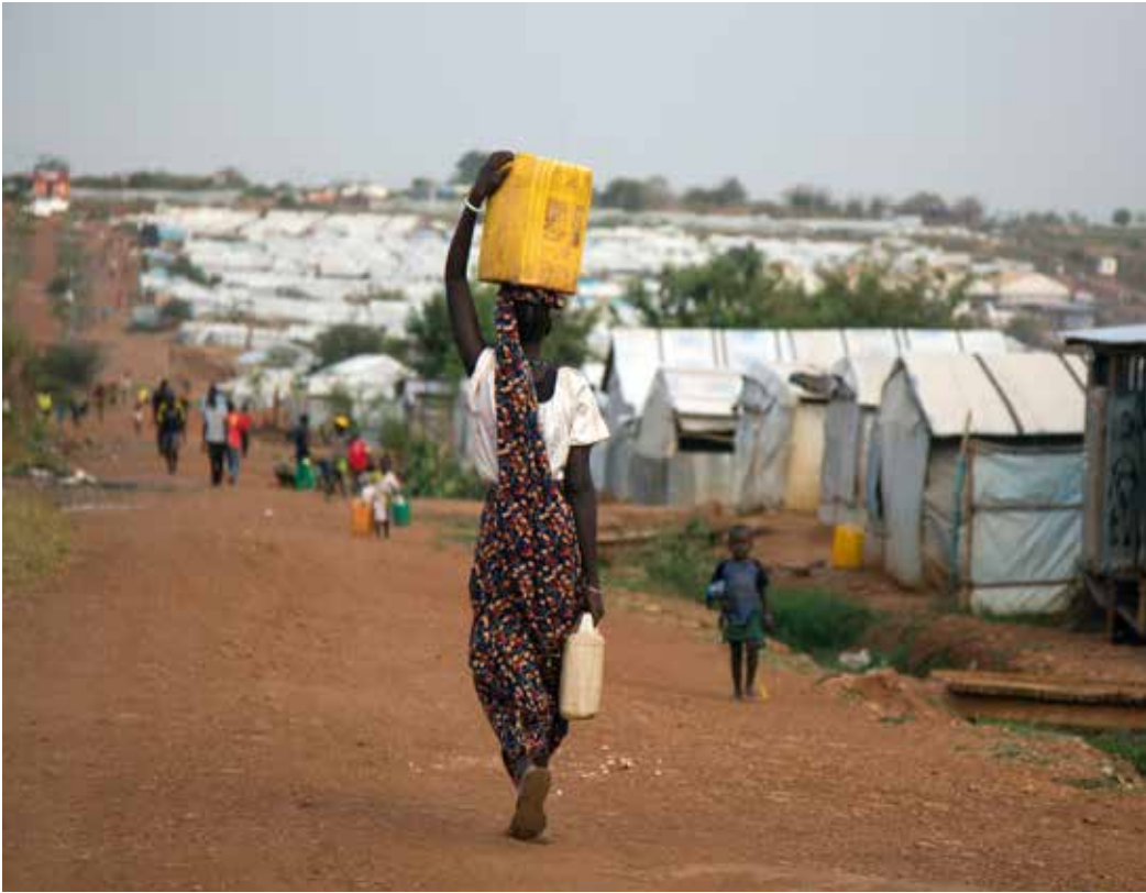
A woman carries water at the UN Protection of Civilians site in Juba, South Sudan. Since the start of the crisis, millions have been displaced and are in need of humanitarian assistance.