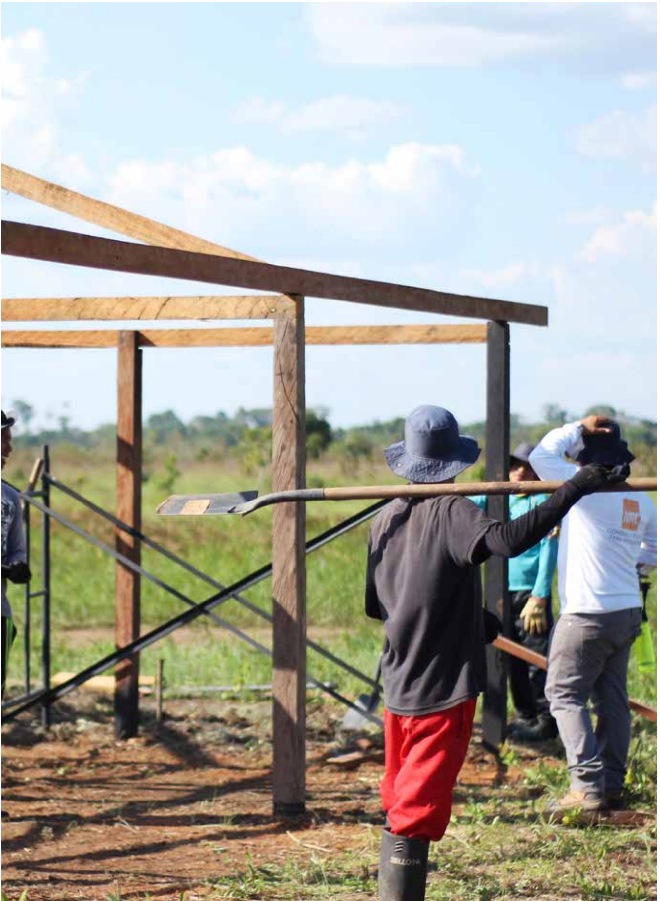
An NRC staff member works alongside the indigenous Jiw community in the Colombian municipality of Puerto Concordia to build homes and community structures. After years of displacement, they have returned to their ancestral land.