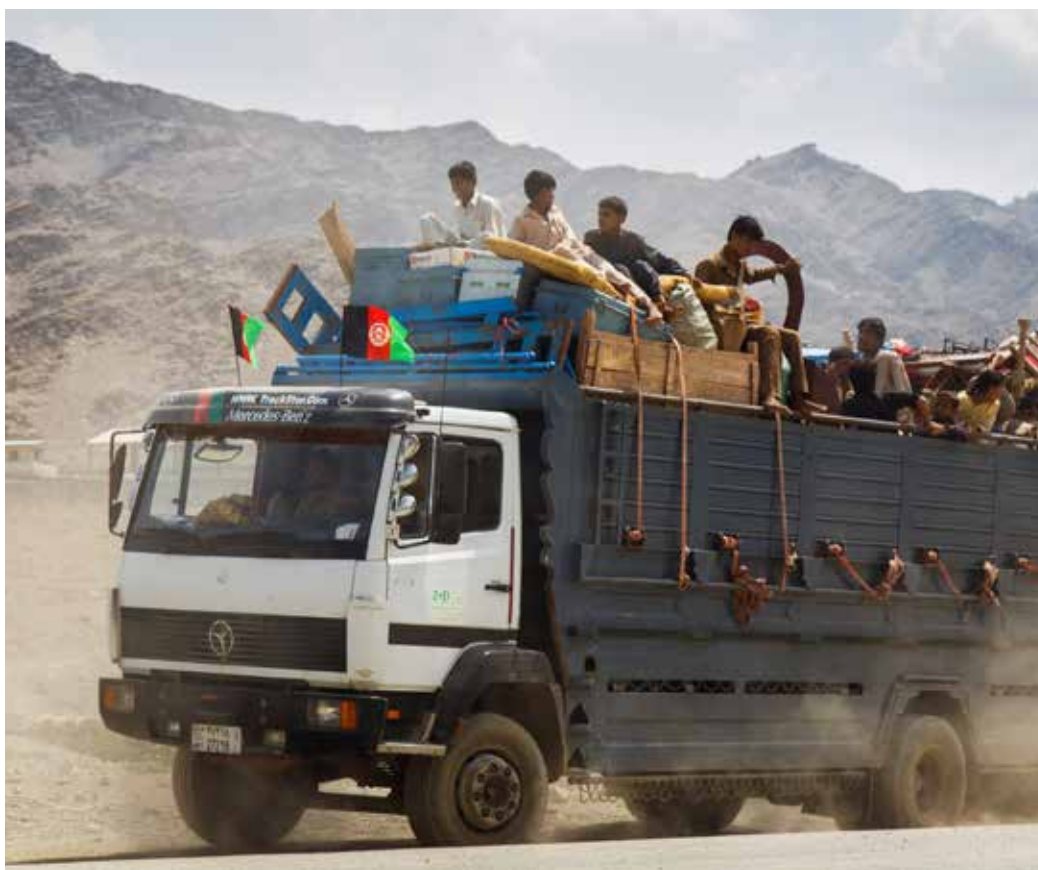
A lorry laden with household belongings and family members zooms towards Jalalabad after clearing the border in Mohmand Dara district, eastern Afghanistan, as thousands of families suddenly felt forced to return to Afghanistan.

NRC primarily works in situations of armed conflict, providing assistance, protection and concrete solutions. In some countries where we operate, we can expand our target group to include people affected by displacement from disasters caused by natural hazards (previously called natural disasters), adverse effects of climate change and generalised violence, and vulnerable migrants. In these contexts, we assess where our displacement expertise and competencies add value, and then engage accordingly. Wherever we are present, NRC prioritises reaching hard to access populations.