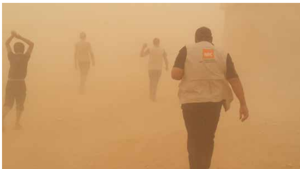
NRC staff, forced to postpone an emergency distribution, seek shelter from a sand storm in Al Waffa camp in Iraq.