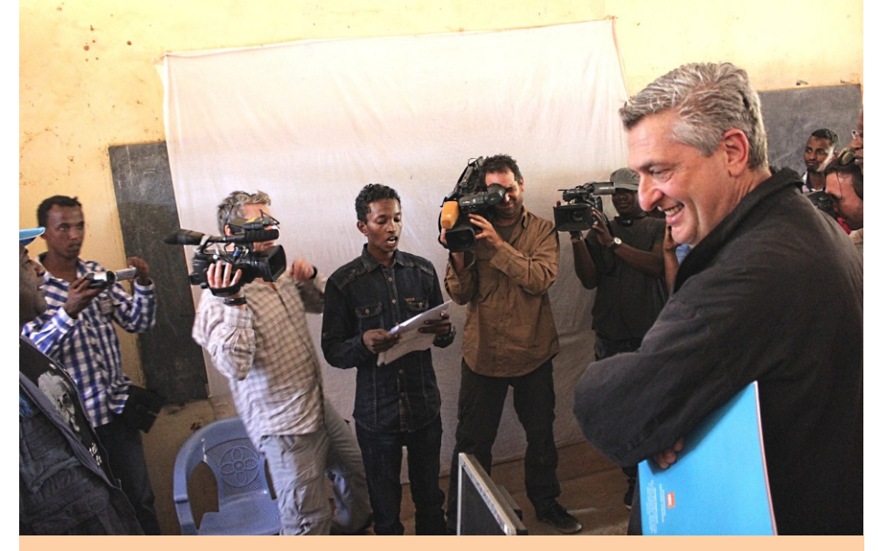
Madaxa qaramada midowbe ayaa la qushuucay kartida ardayda barata saxaafada ayna heer ka gaaraan xirfadooda warbaahineed." waxaan ku faraxsanahay marqaatina ka ahay soo bandhigitan,fadlan dadaalkiina sii wada", ayuu ardayda u sheegay.