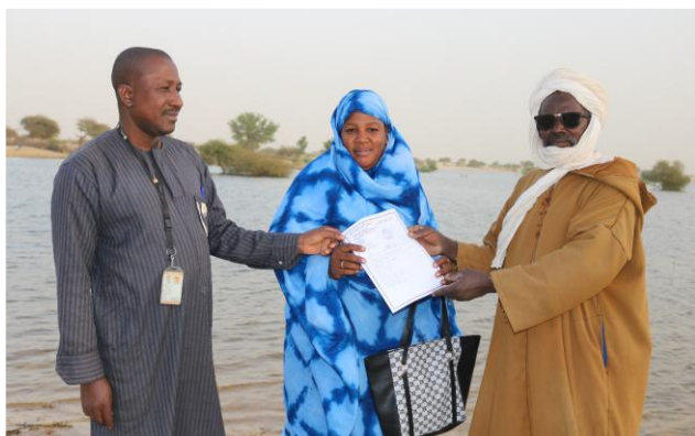
Presentation of a donation certificate securing land rights for a women's group in Timbuktu.

The certificate has allowed the cooperative to continue farming with greater peace of mind and to invest more confidently in their agricultural activities. For many women in the group, the garden has become an important source of income, supporting their households and improving their living conditions.