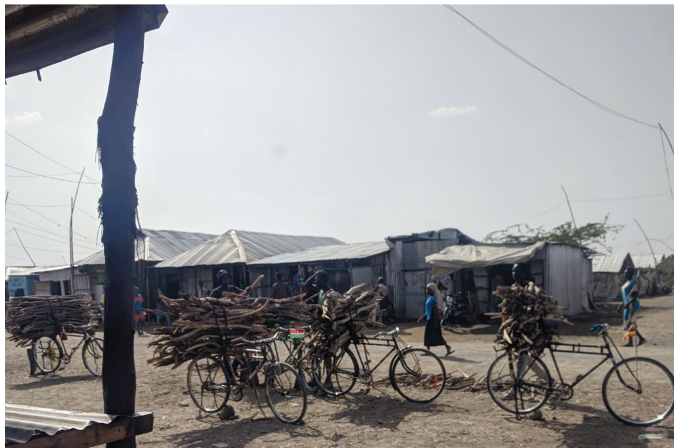
Kakuma IV market, January 2018. IHRC.

Kenya's encampment policy was further formalised in 2016 through amendments to 2009 regulations issued under the Refugees Act, specifying that “[a] refugee or an asylum seeker shall be required to reside within a designated refugee camp” and that