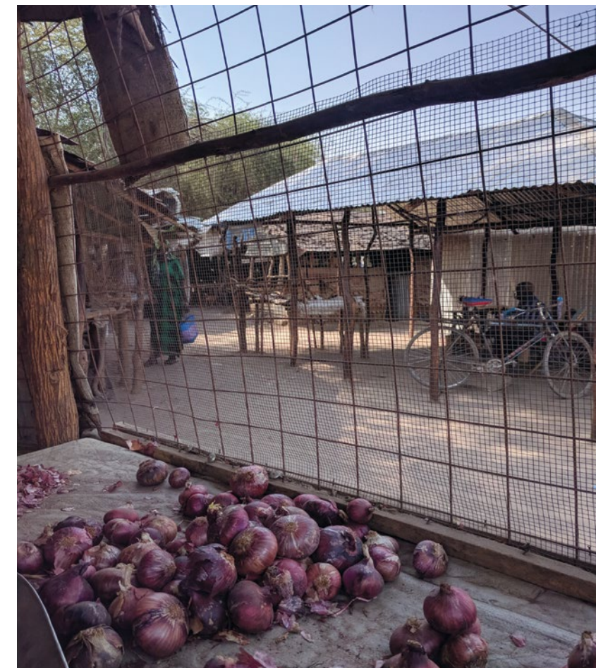
A market in Kakuma I, January 2018. IHRC.