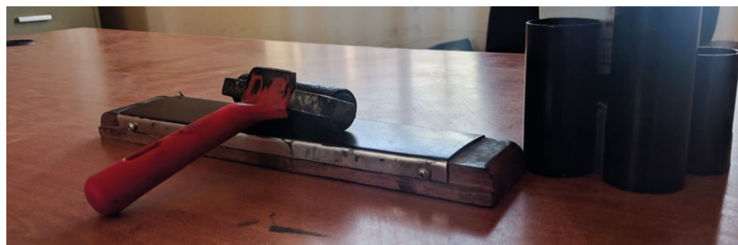
A roller and ink pad used in the issuance of movement passes in Kakuma, January 2018.

A number of refugees emphasised the likelihood of arrest and fines for those who travel outside Kakuma without a movement pass. In NRC’s survey, 21 per cent of respondents said they had left Kakuma without a movement pass at some point in the past – most (17 per cent of respondents) had done so only once. Men were more likely to have travelled outside Kakuma without a movement pass than women: 26 per cent of men said they had left Kakuma without a movement pass on one or more occasions, while only 17 per cent of women said the same.