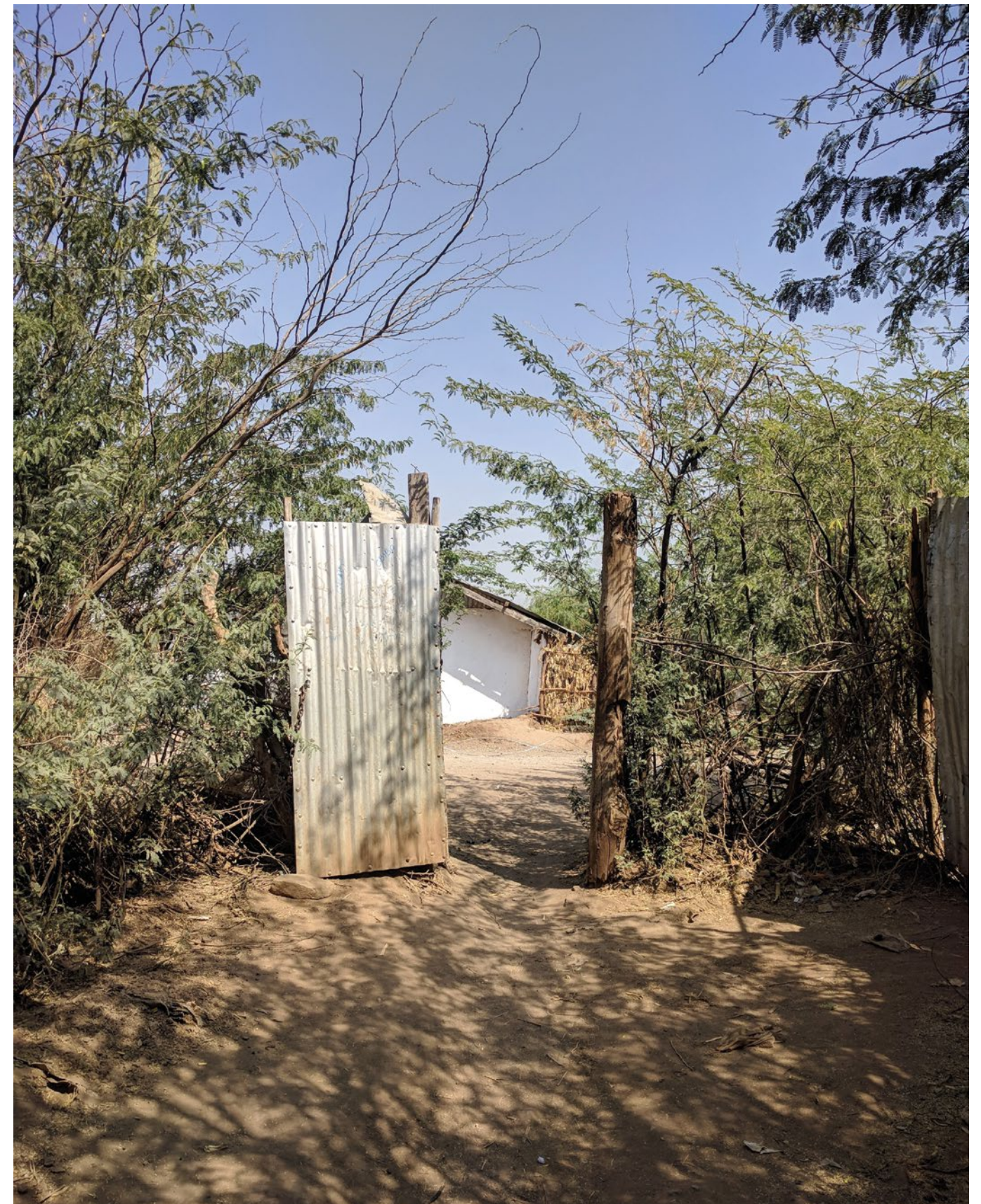
A shelter in Kakuma I, January 2018. IHRC.