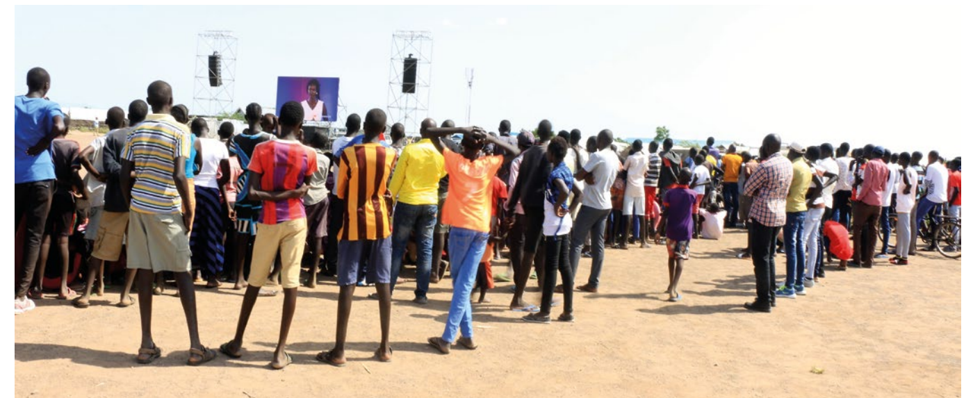
A group of refugees gather in Kakuma for a TEDx talk, June 2018.

NRC’s survey confirms that Kakuma’s refugees experience high unemployment and limited work and business opportunities. Two thirds of respondents said that they relied on humanitarian assistance as a primary form of support, and only 19 per cent indicated that they earned money through employment (self-employment, casual labour, or otherwise) or business. Just over half (51 per cent) of those earning money earned less than 5,000 KSH ($50 USD) a month, and a further 44 per cent earned between 5,000 and 10,000 KSH ($100 USD) a month. Seventy per cent of respondents cited the lack of opportunities in Kakuma as a barrier to