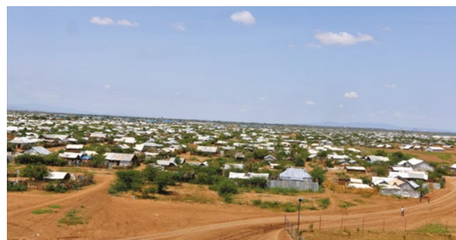
Kakuma refugee camp, 2018.

Kakuma refugee camp was established in 1992 on desert terrain with an average temperature of 35 degrees Celsius, limited access to water, and regular dust storms. It is located in Kenya's northwest corner – one of the poorest and most remote parts of the country – in Turkana County, home to the largely nomadic Turkana ethnic group. In 2015, the Turkana County government set aside land for the creation of Kalobeyei, a refugee settlement intended to decrease overcrowding in Kakuma refugee camp. Kalobeyei lies 25 kilometres northwest of the camp and is designed to be an "urban centre" that will integrate the refugee and local Turkana populations. Despite the planned integrated settlement model, in practice Kalobeyei refugees are subject to the same movement restrictions as refugees living in Kakuma refugee camp. In this briefing paper, "Kakuma" refers to Kakuma refugee camp, as well as Kalobeyei settlement. As of July 2018, more than half of Kakuma's population hails from South Sudan, just under a fifth from Somalia, and