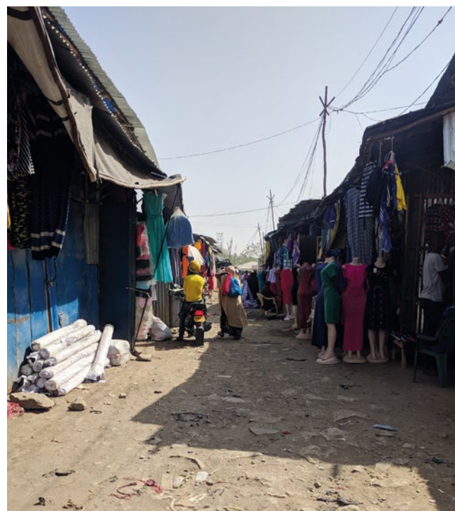
A market in Kakuma I, January 2018.

As refugees cannot sell their goods or pursue clients beyond Kakuma without a movement pass, their business opportunities are generally limited to the local market and local clients. Refugee electricians and plumbers, for example, noted that essentially the only client base for tradespeople is international organisations operating in the camp. The inability to pursue clients and sell goods outside Kakuma heightens competition for already limited opportunities within the camp, and prevents refugee-owned businesses from reaching their full potential.