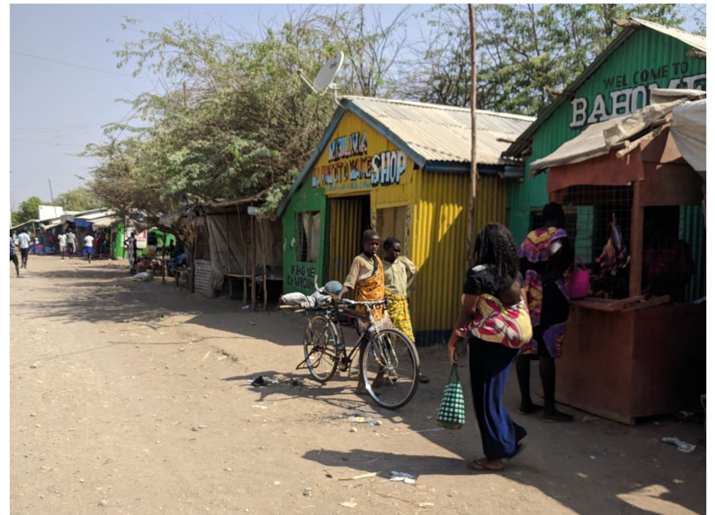
Market in Kakuma I, January 2018.

of movement and residence within the borders of a State provided he abides by the law.” ○ Although “provided he abides by the law” appears to allow for a wide range of permissible restrictions on the right to freedom of movement, the African Commission on Human and Peoples’ Rights has held that restrictions must meet additional requirements drawn from other parts of the Banjul Charter. 50 Namely, restrictions on freedom of movement and residency must: be undertaken for a prescribed set of legitimate aims; satisfy a necessity and proportionality analysis; and not infringe on other rights laid out in the Banjul Charter. 51 In effect, these requirements align the right to freedom of movement under the Banjul Charter with the equivalent right enshrined in the ICCPR.