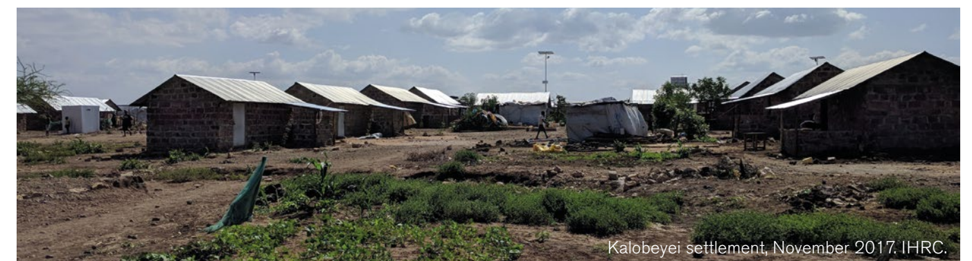
Kalobeyei settlement, November 2017.

As a settlement, Kalobeyei represents a different model of refugee assistance from a refugee camp. The settlement model is designed to promote refugee and host community self-reliance through better livelihood opportunities and enhanced service delivery, underpinned by the Kalobeyei Integrated Social and Economic Development Plan (KISEDPP), which is led by local authorities. UNHCR originally estimated that Kalobeyei would host a local population of 20,000 and a refugee population of 60,000, 14 but now anticipates a total population of 45,000, with the host community mainly residing around the settlement. Despite being planned as a settlement, in practice refugees from Kalobeyei are subject to the same