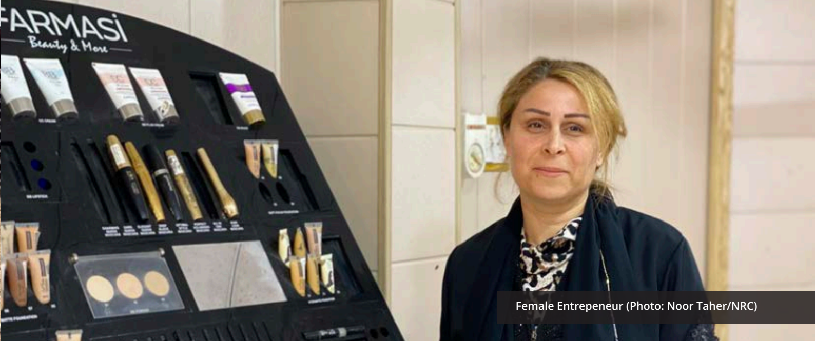
Female Entrepreneur