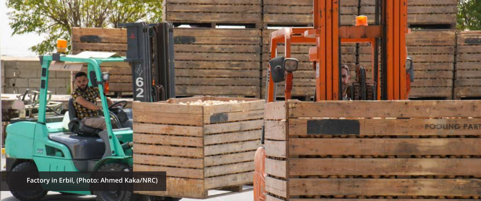
Factory in Erbil, (Photo: Ahmed Kaka/NRC)