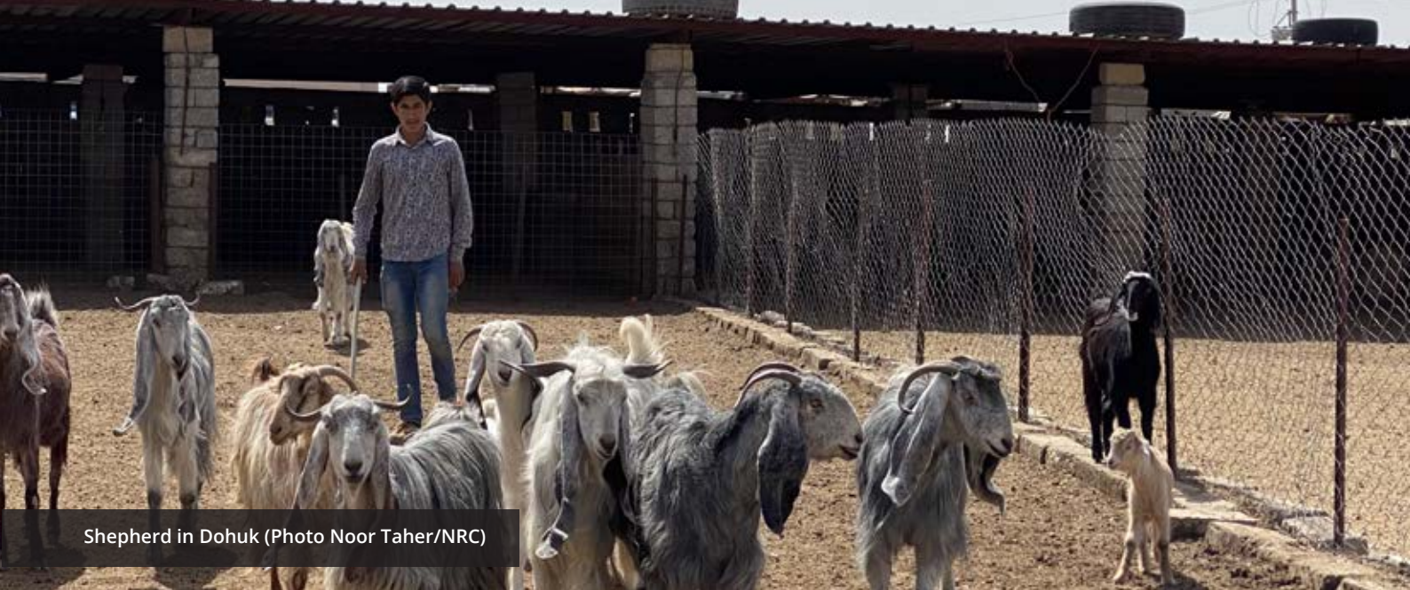
Shepherd in Dohuk