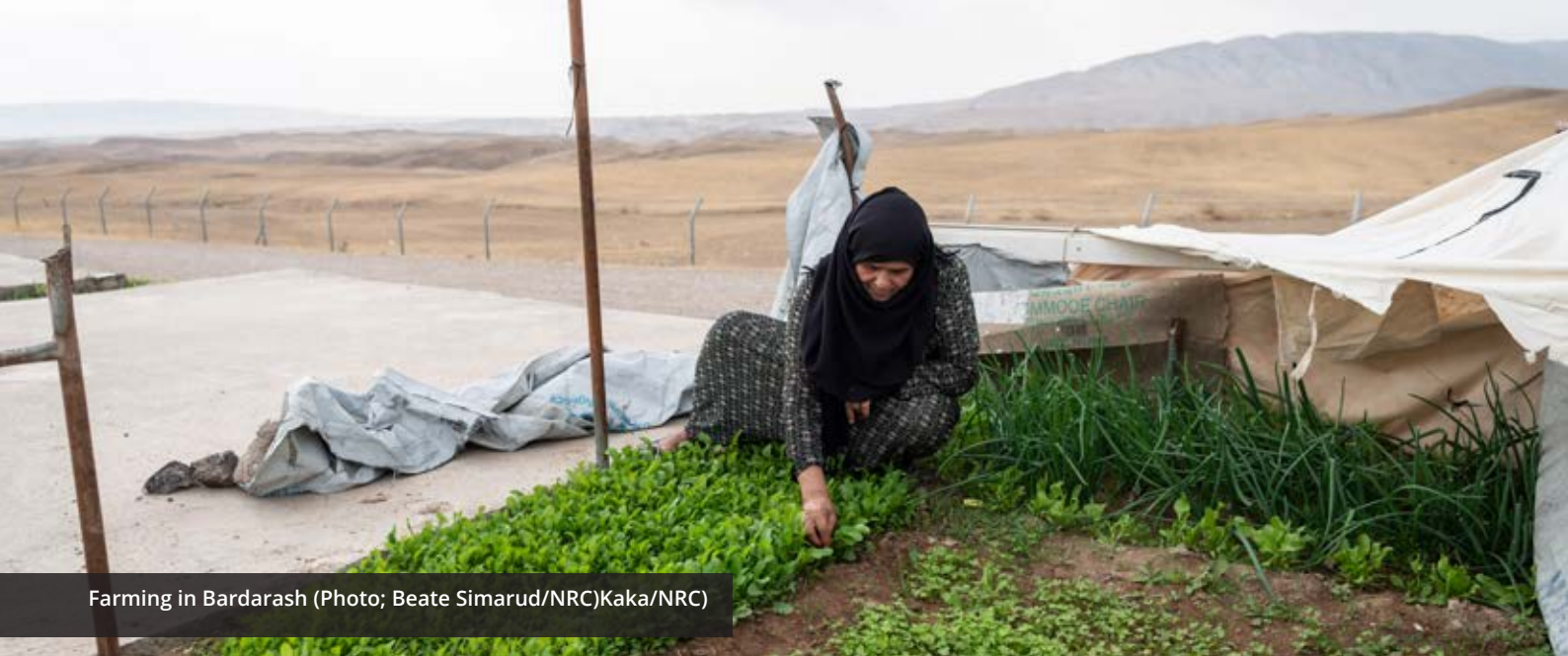
Farming in Bardarash