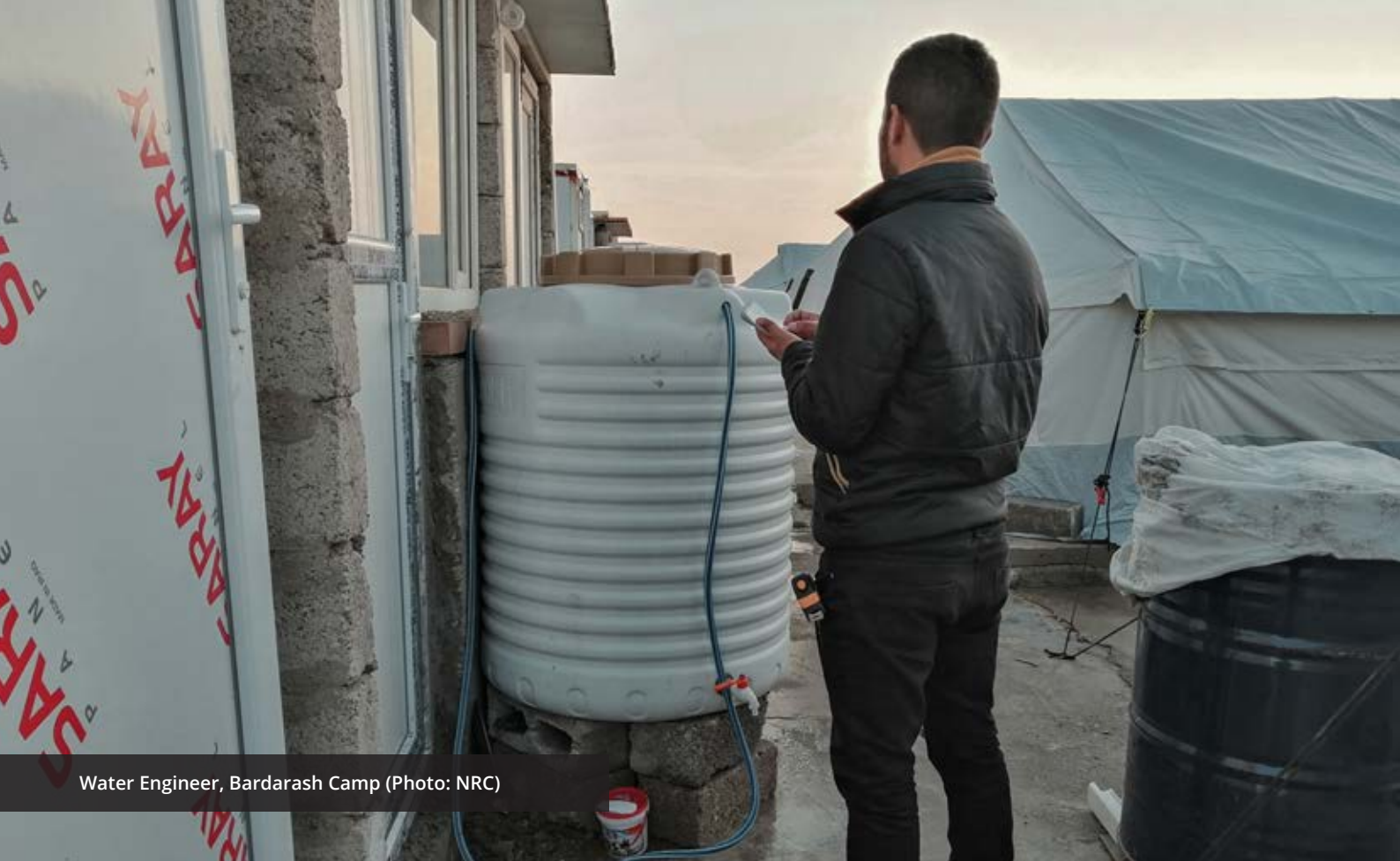
Water Engineer, Bardarash Camp