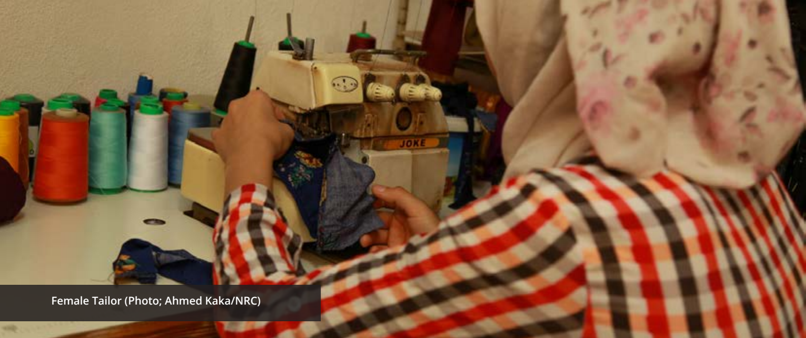
Female Tailor