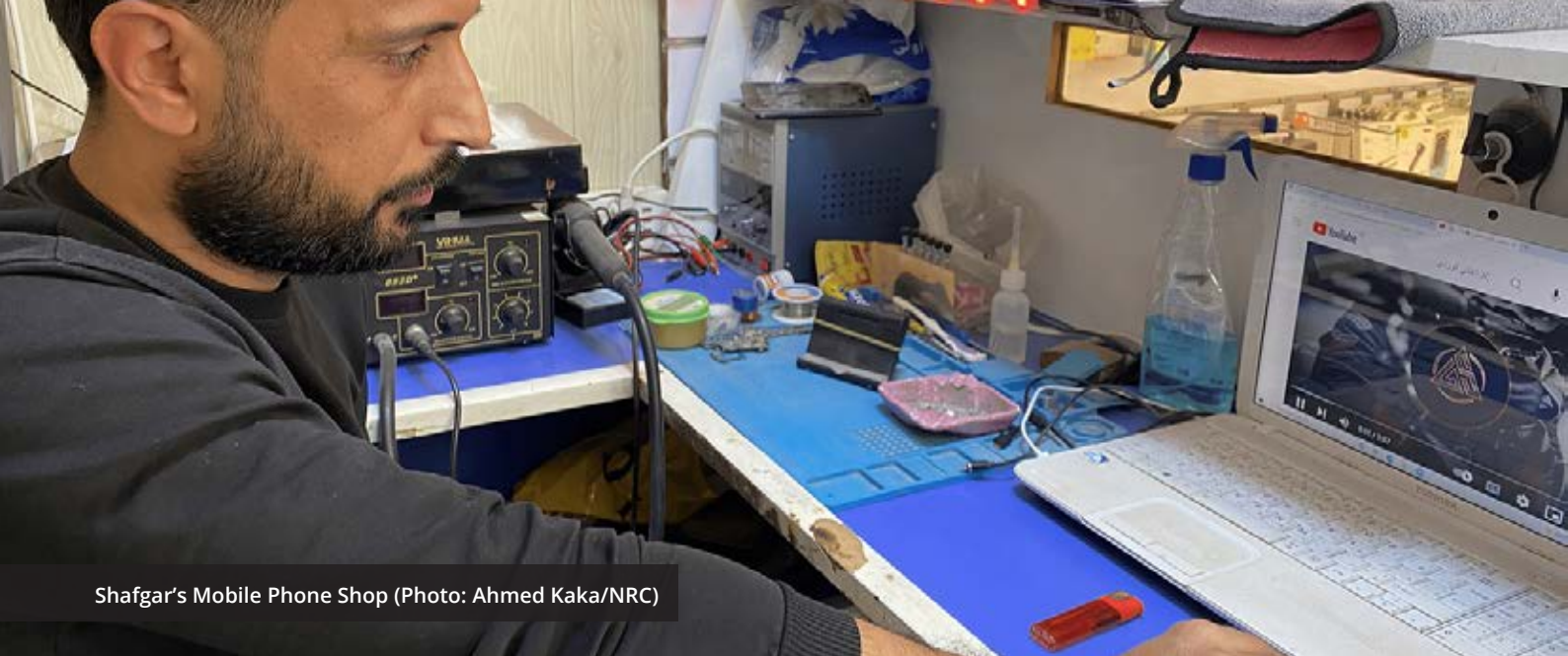
Shafgar's Mobile Phone Shop