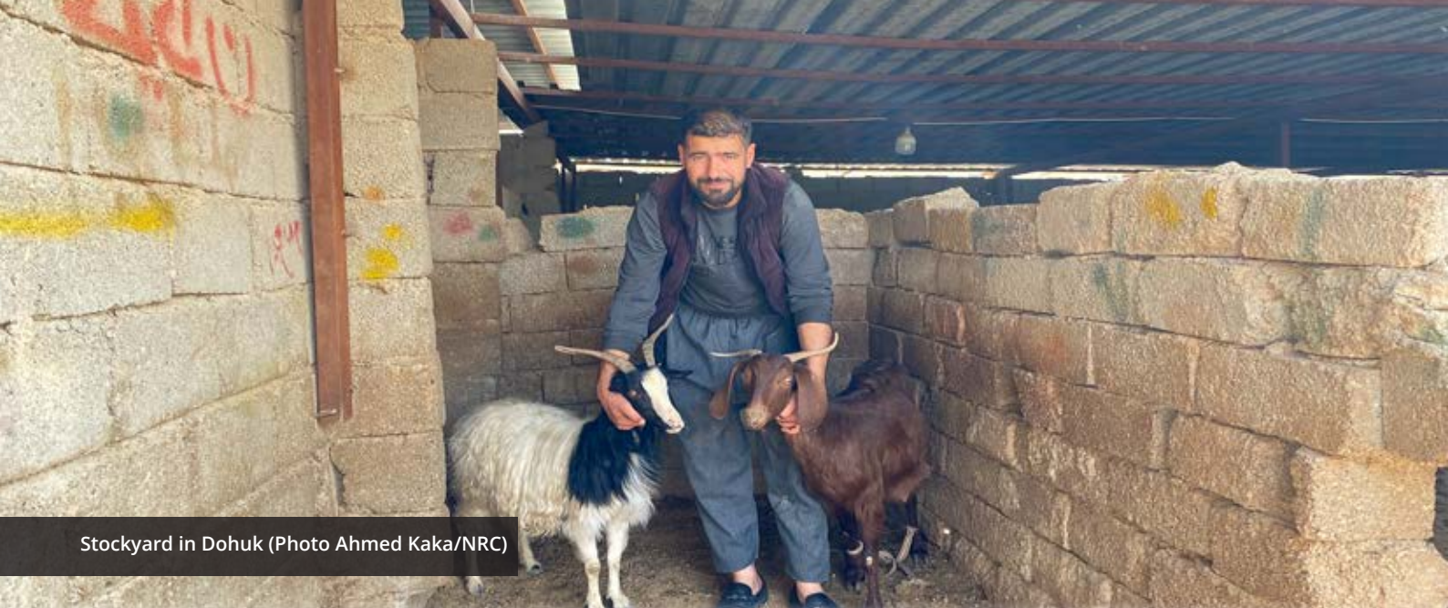
Stockyard in Dohuk