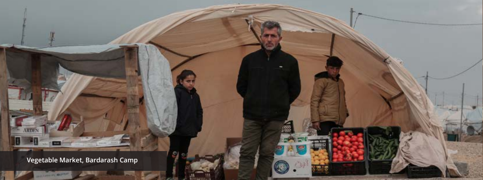
Vegetable Market, Bardarash Camp