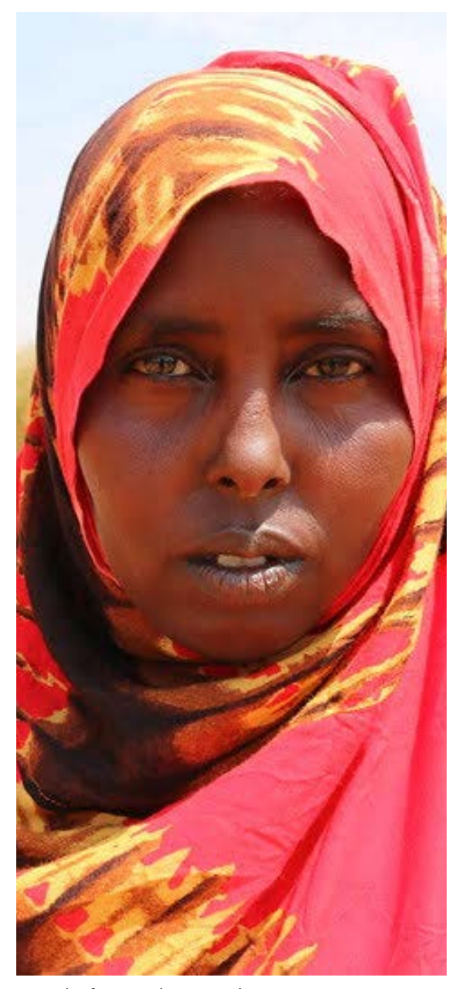
Portrait of woman in IDP settlement.

Consider replication, based on a similar mapping exercise in no. 17above, of PRMN in other standalone countries.