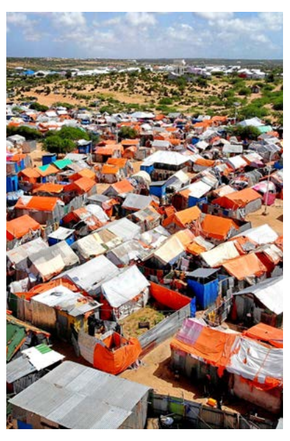
An aerial footage of Kahda IDP settlement, outside of Mogadishu.

Donors reported that PRMN data informs their reporting and, at sometimes, their responses. A UNHCR respondent noted, "The data is very useful. We use it on a daily basis, and we share the data, which then helps with our advocacy and planning." In 2020, ECHO allocated funding to respond to the flooding based on PRMN data. Moreover, ECHO used PRMN data to justify Crisis Modifier funding.