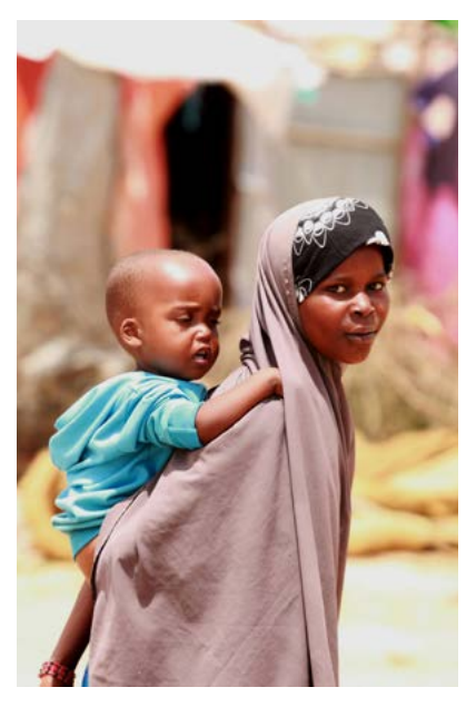
Young girl and her sibling in Kahda IDP settlement, outside of Mogadishu.

In the Partner Survey, 14 out of 26 respondents (54%) described the sustainability of PRMN as strong or exceeding expectation, while an additional nine (36%) described it as satisfactory. Among the factors contributing to sustainability, partners noted: the long-term nature of the PRMN data over time; the ability of stakeholders to use PRMN data to contribute to long-term solutions; and the use of local organizations and local monitors to collect data. As one monitor noted, "The system supports local organizations and community structures, which contributes to sustainability upon exit of the project." Another partner Project Manager noted, "The project is run by local NGOs and that can increase the project ownership and sustainability." Partners also noted what they considered to be challenges for sustainability, including factors such as: lack of resources; inadequate training for finance and monitors; lack of interventions by the project that go beyond monitoring; the risk faced by monitors working in areas of active conflict; and limited capacity strengthening for local NGOs.