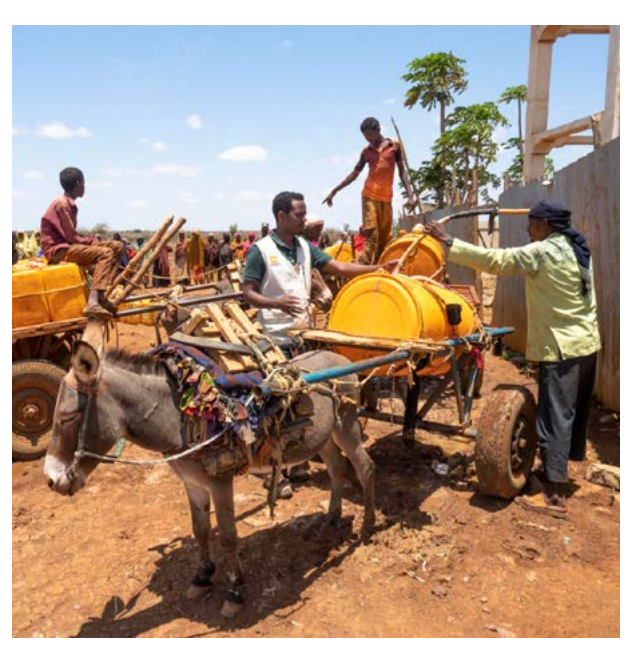
Landscape photo of people fetching water in Dollow.