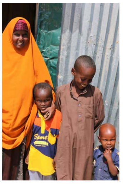
Family living in settlement in Mogadishu.

This evaluation found that PRMN is effective in that it achieved its objectives and its results. Of the three core objectives, the evaluation found the strongest evidence with the first (avail information) and third (protection assessment capacity) objectives. PRMN's success in collecting the relevant data and increasing protection assessment capacity is notable, through its use of an interactive online dashboard showing displacement statistics, and through the analysis and uptake of information related to protection incidents. PRMN's significant contribution is evident in the fact that both of these activities in Somalia would be notably weaker without PRMN. There was also evidence of the increase in access to emergency protection response (second objective). However, there was more debate here concerning the project's success in the implementation of the Emergency Protection Assistance (EPA). There is no question of the significant needs of displaced persons in Somalia, nor of the importance of the EPA in responding to these needs. Stakeholders' main concerns were the EPA's relatively small size and the limitations in being able to respond