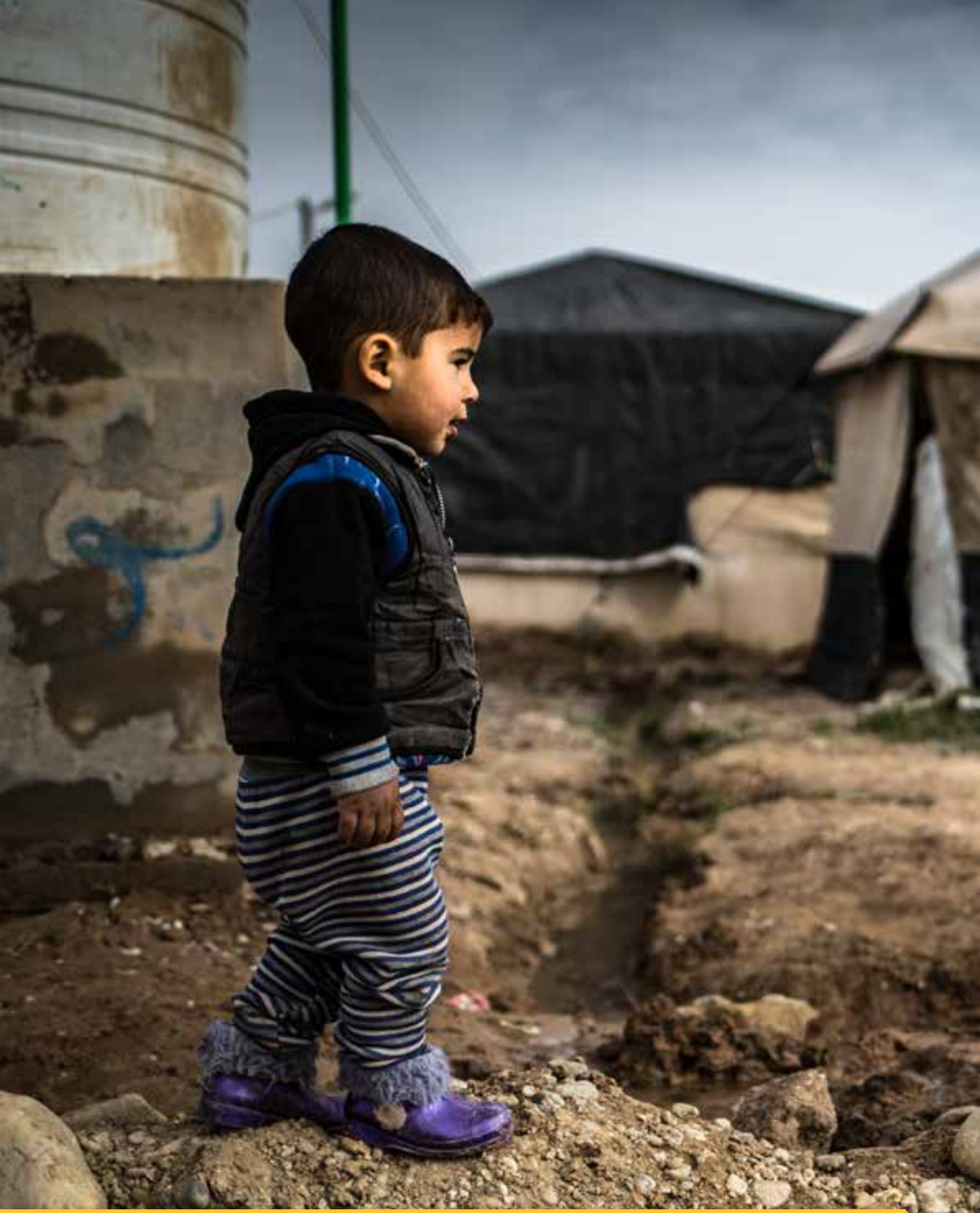
A child takes his first steps in Hammam Al-Alil camp near Mosul. Children see their movement several limited when they lack civil documents.